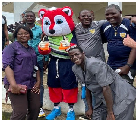
Surge Soccer Liberia

“For to us a child is born, to us a son is given; and the government shall be upon his shoulder, and his name shall be called Wonderful Counselor, Mighty God, Everlasting Father, Prince of Peace.”